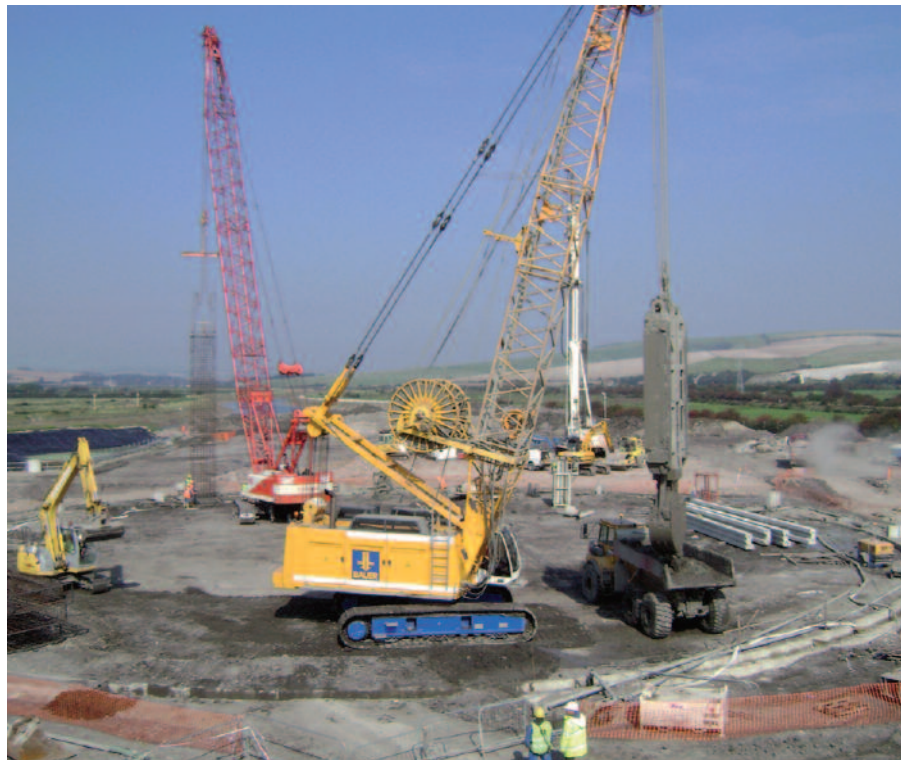
Excavation with BAUER grab and reinforcement installation with service crane

The diaphragm wall and barrettes were completed 3 weeks ahead of schedule to bring Hochtief's overall construction scheme back on track after a delay at commencement of the project.